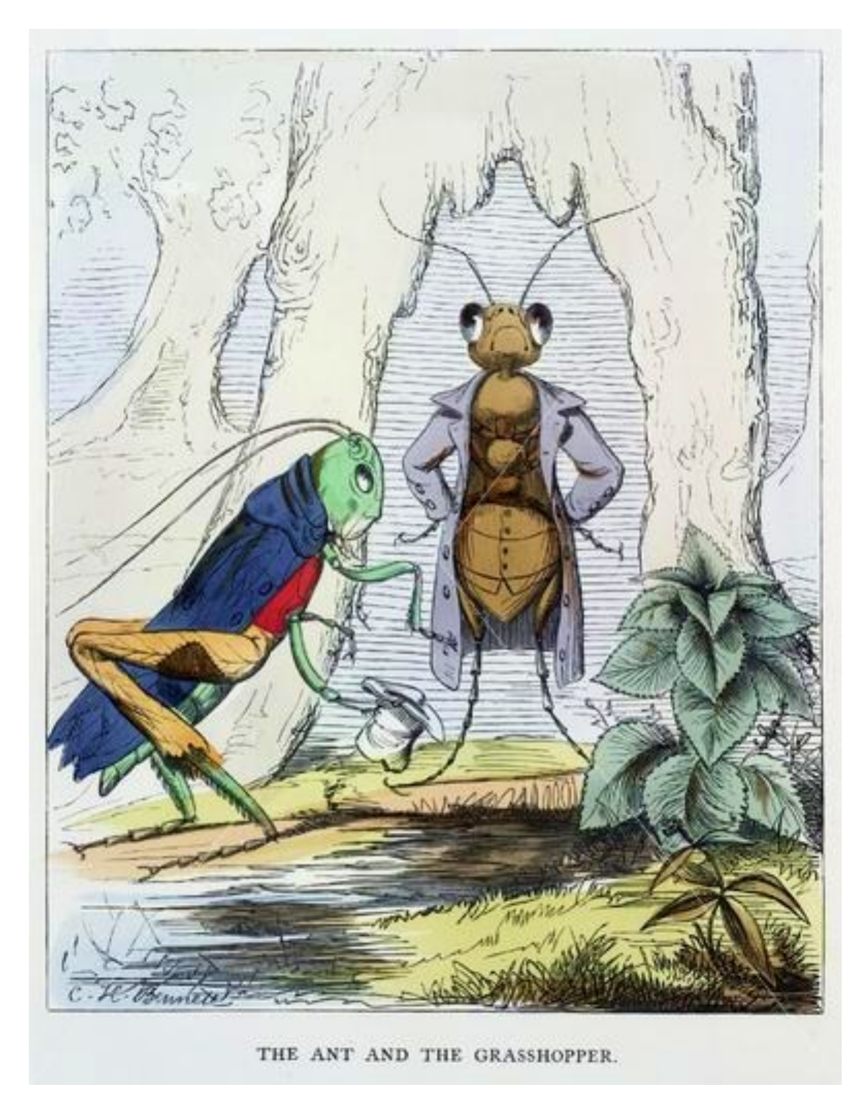
Aesop's Fables has the famous story of the ant and the grasshopper.

Does this picture give you an idea of how big a grasshopper compared to an ant? Why?