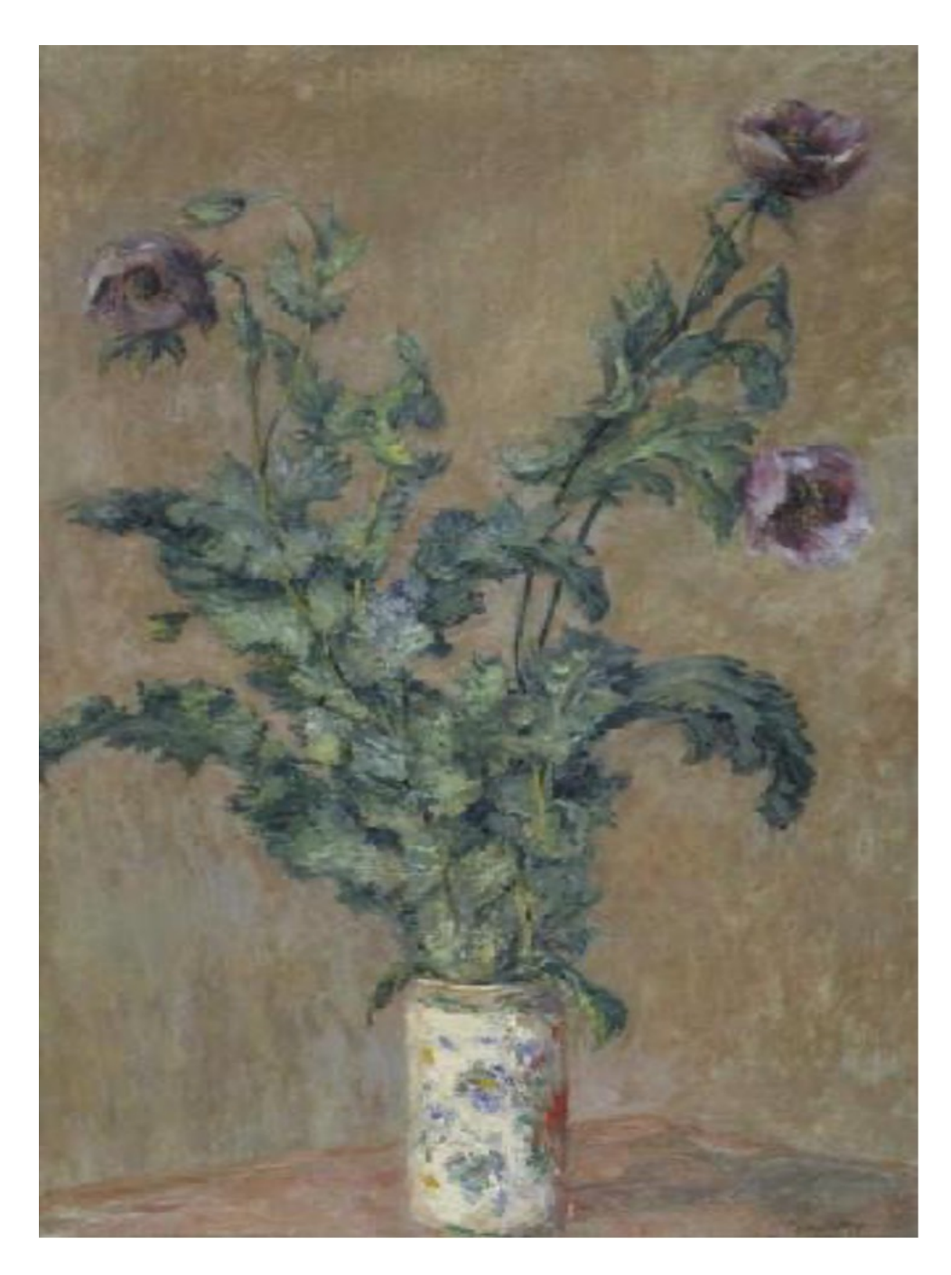
Claude Monet did this picture of a plant. Do you see any ants around it? What color are the flowers? Do you think the plant is large? The vase is in the shape of a cylinder. Can you draw a cylinder?